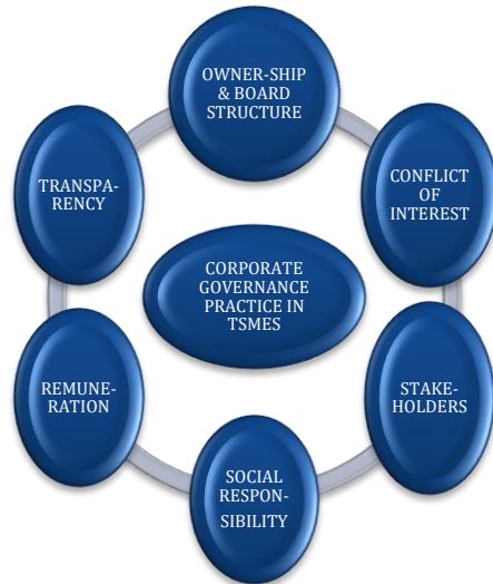
Fig. 1: Components of corporate governance practice for TSMEs in Malaysia

governance practice must highlight this as vital component to be taken into account to determine best practice for TSMEs. Additionally, the study is also in line with previous study by Magaisa et al. (2013) where they noted that it is difficult for the organizations to have board members who are separate from the stakeholders and who are capable to run and account for the running of the organizations.